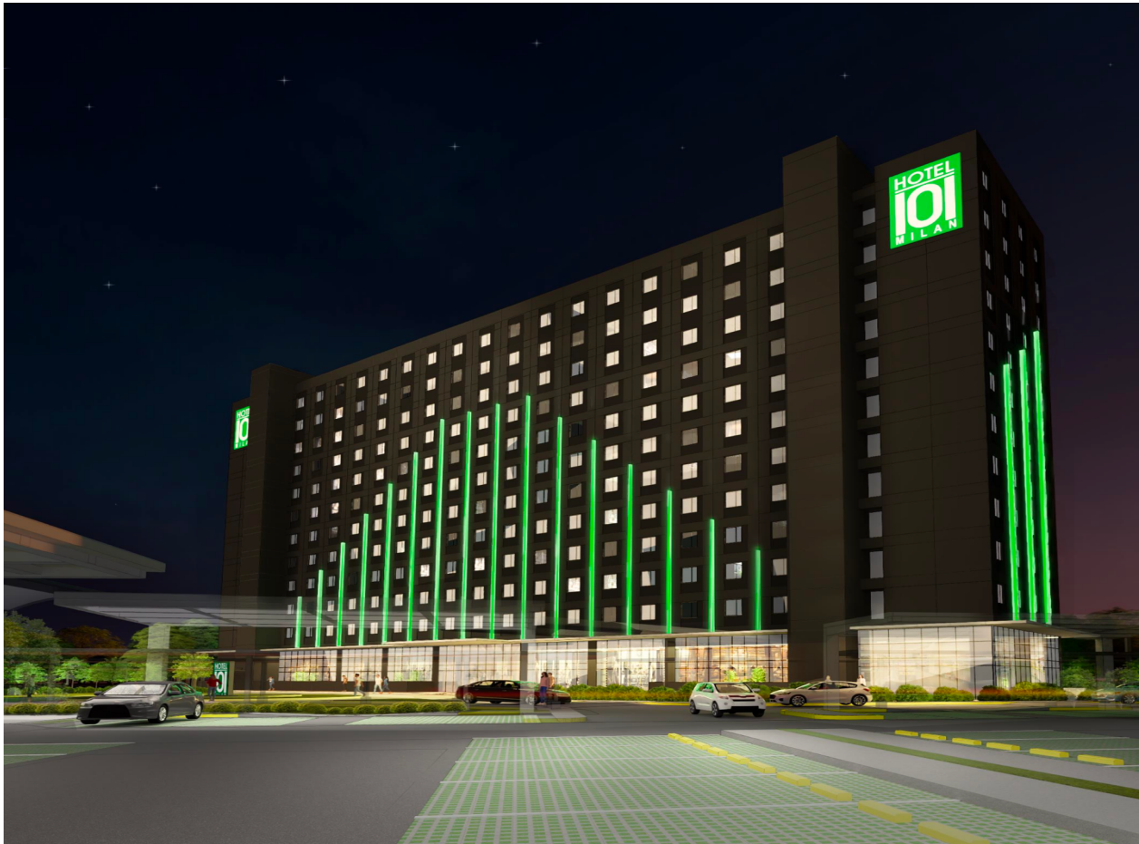
(Perspective of Hotel101-Milan, Italy set to have approx. 429 rooms)

across 100 countries worldwide, with an initial 25 identified priority countries for the medium term. Hotel101 is a subsidiary of Philippine-listed DoubleDragon Corporation (PSE Ticker: DD).