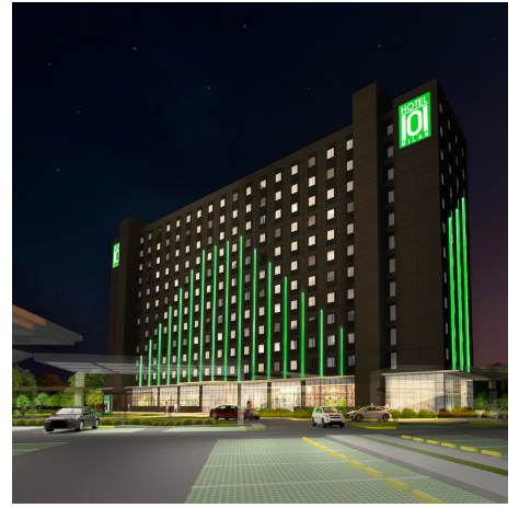
Perspective of Hotel101-Milan, Italy set to have approx. 429 rooms